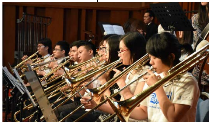
Figure 3 Students join campus symphony band

Most of the reasons why students join the campus symphony orchestra are due to their own curiosity and interests, as shown in figure 3, 77% of the students are motivated to join the campus symphony orchestra because of their own curiosity and interests, and only a very small number of students are for later employment. Therefore, the formation of symphony bands, is completely the best choice for students to relax, which not only provides students with an open learning environment, but also enhances the artistic competitiveness of the school.