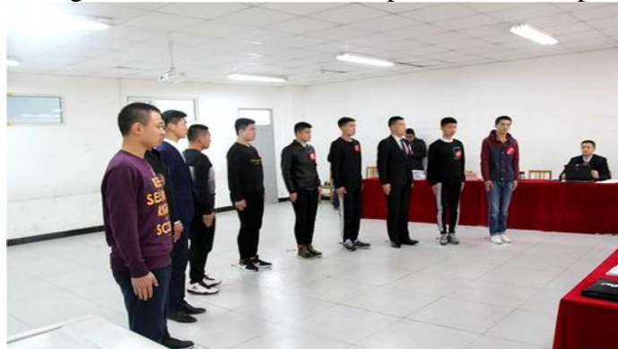
Figure 2 Symphonic orchestra training

Guangdong Province is a relatively developed coastal area, the art development space is large, thanks to its superior geographical location and economic development, the campus symphony band development trend has been very good in recent years. As can be seen from figure 2, colleges and universities in Guangdong province have raised the demand for admission in order to better develop orchestras. Colleges and universities have their own campus symphony band, and the activities of the campus activities, to bring more active artistic atmosphere to the campus.